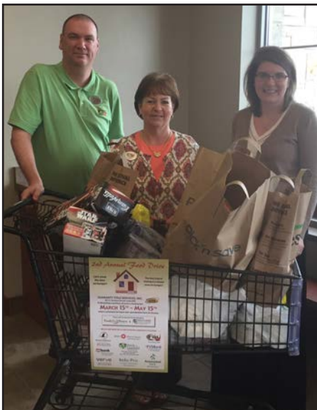
Cart one of two full of food for the Fondy Food Pantry.

We're proud to be part of the Fond du Lac community!