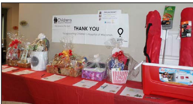
Baskets created and donated by employees raised $634 for Children's Hospital in our silent auction this year!

Remember, Online Banking, the Mobile App and Debit Cards are great alternatives when our office is closed!